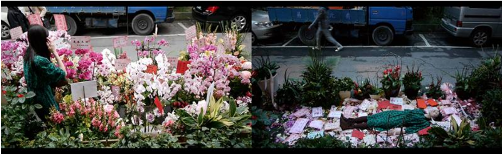
Flower Basket Show