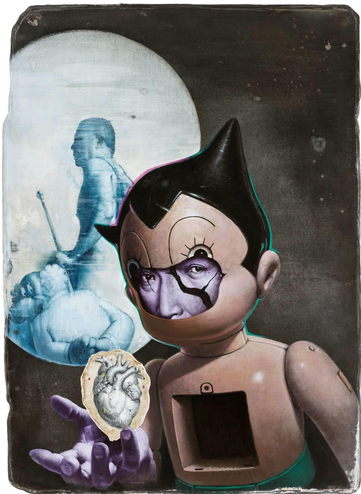
Revealing of the Astro Boy 2019, Oil on canvas, 125x92 cm