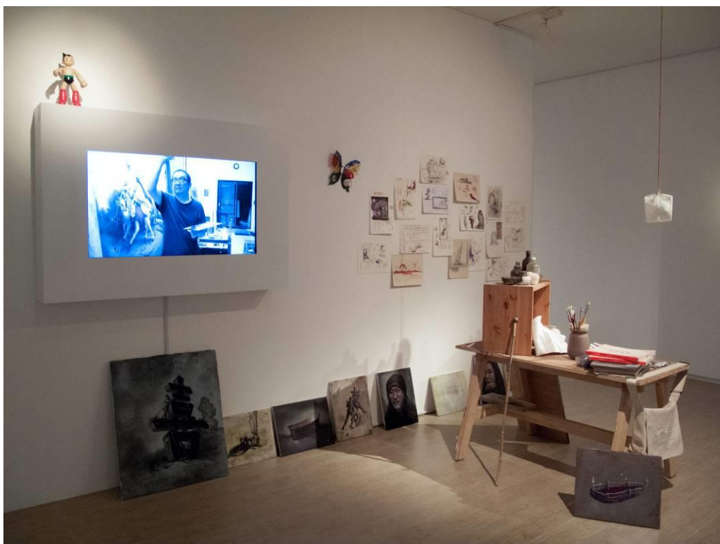
Forbidden Wishes , 2013, Lin & Lin Gallery