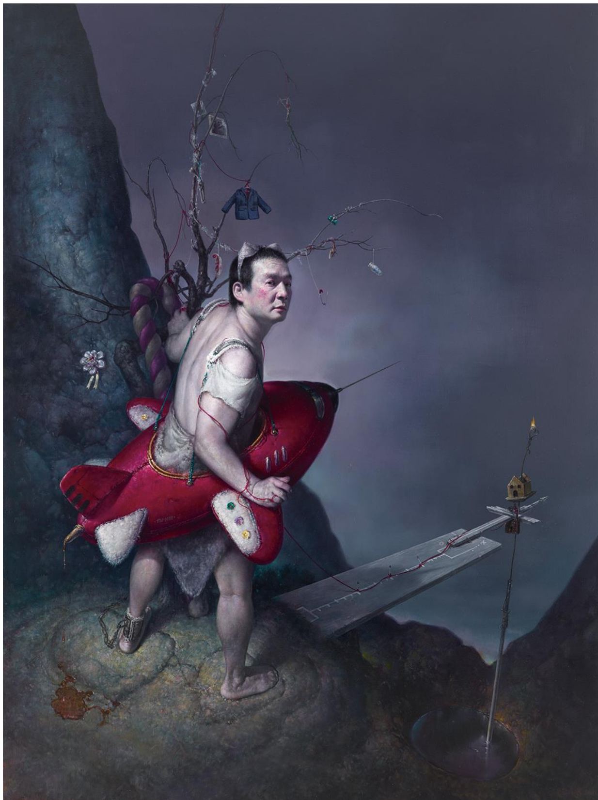
Red little plane-TW1688