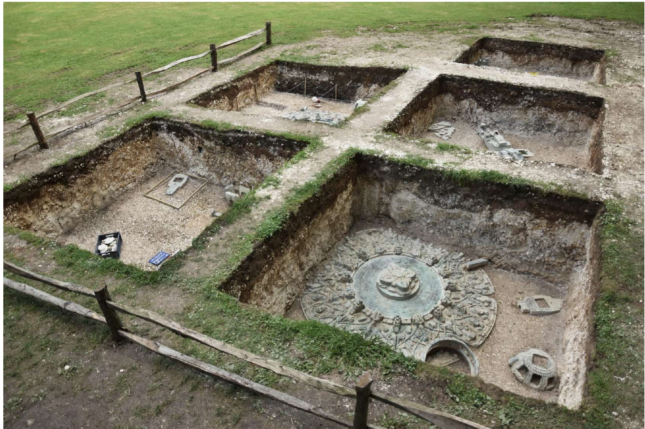
BU NUM CIVILISATION, 2016 Mixed-media installation 15 x 10 x 2 m