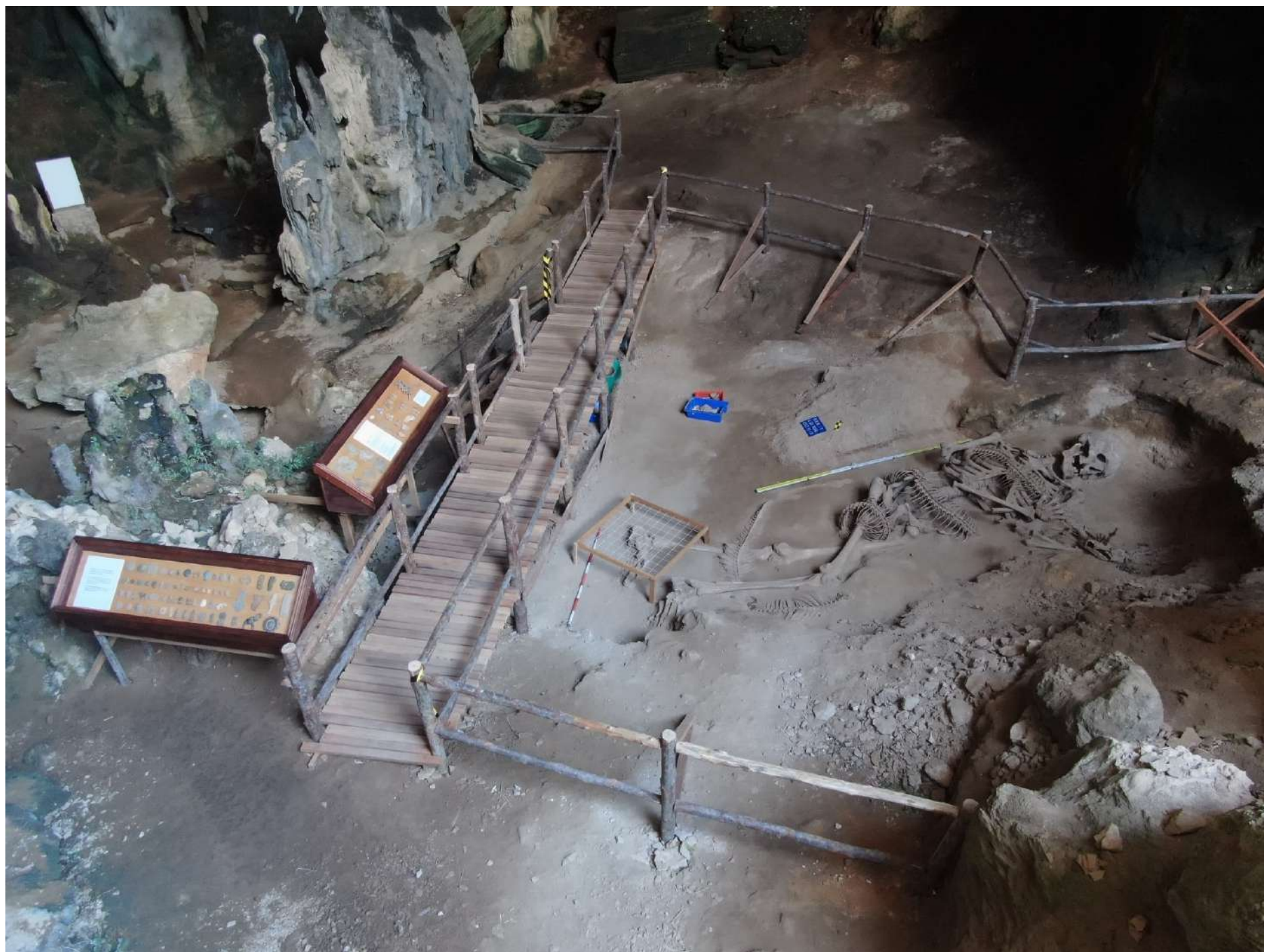
KRABI GIANT RUINS, 2018 Mixed-media installation Dimensions variable