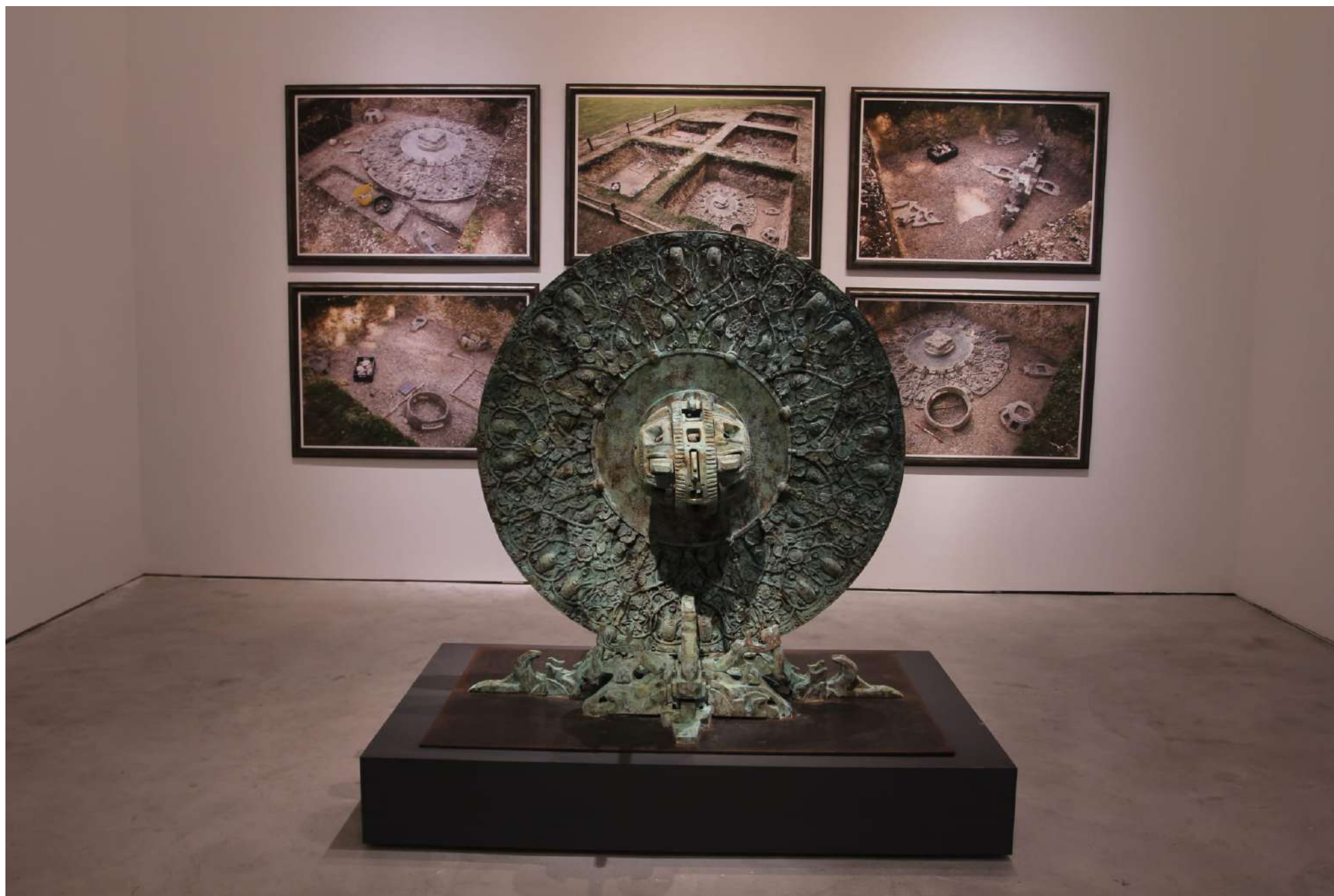
CIVILIZATION WHEEL NO. 2, 2017