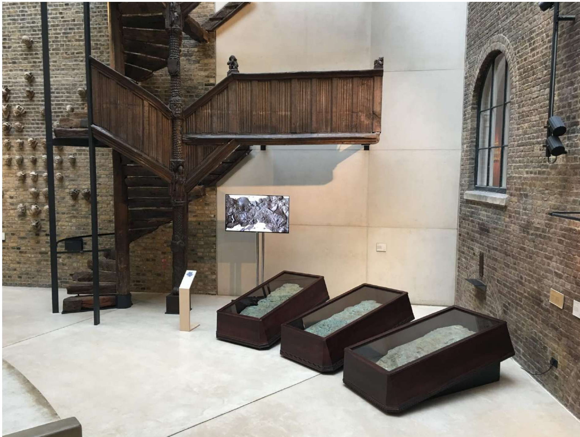
ENFOLDED WORLD: MYSTERIES OF LOST CIVILIZATIONS, 2017