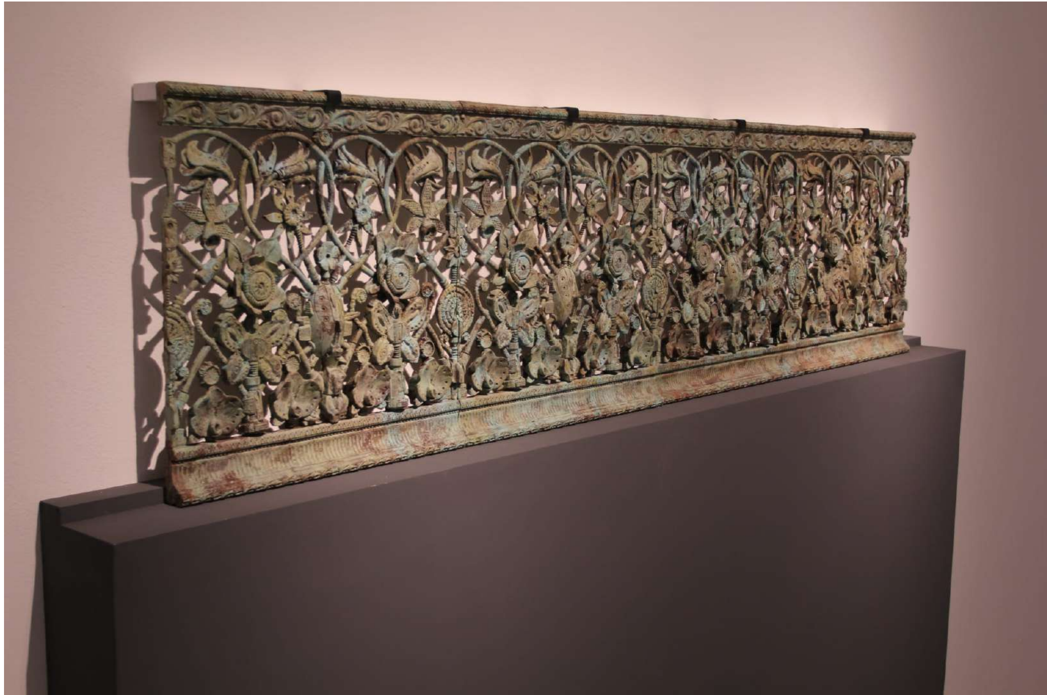
GLORY IN THE FLOWER NO. 1, 2017 Bronze 44.5 x 176 x 4.5 cm