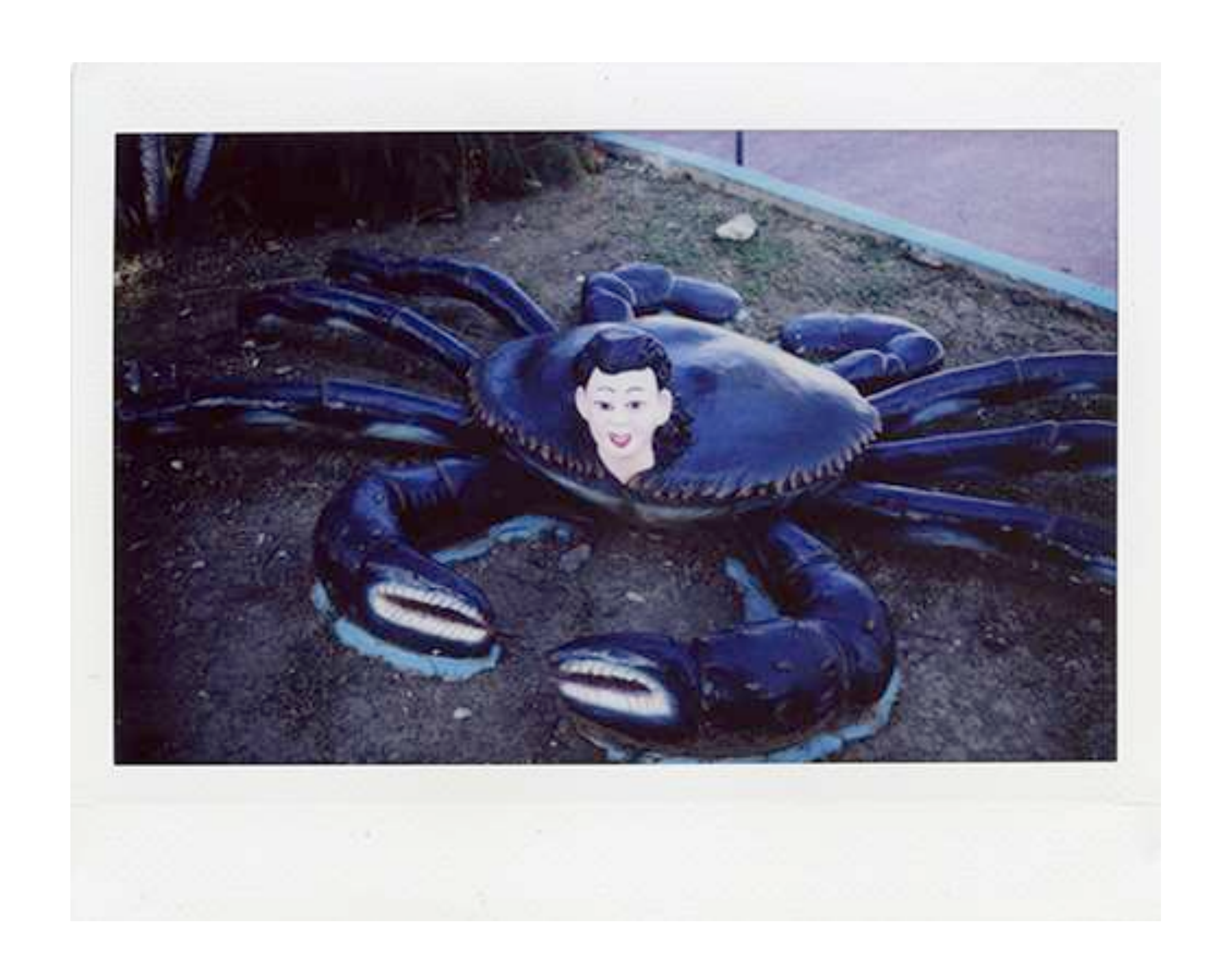
Hell Plus | 2018 | Polaroid | 50 x 50 cm