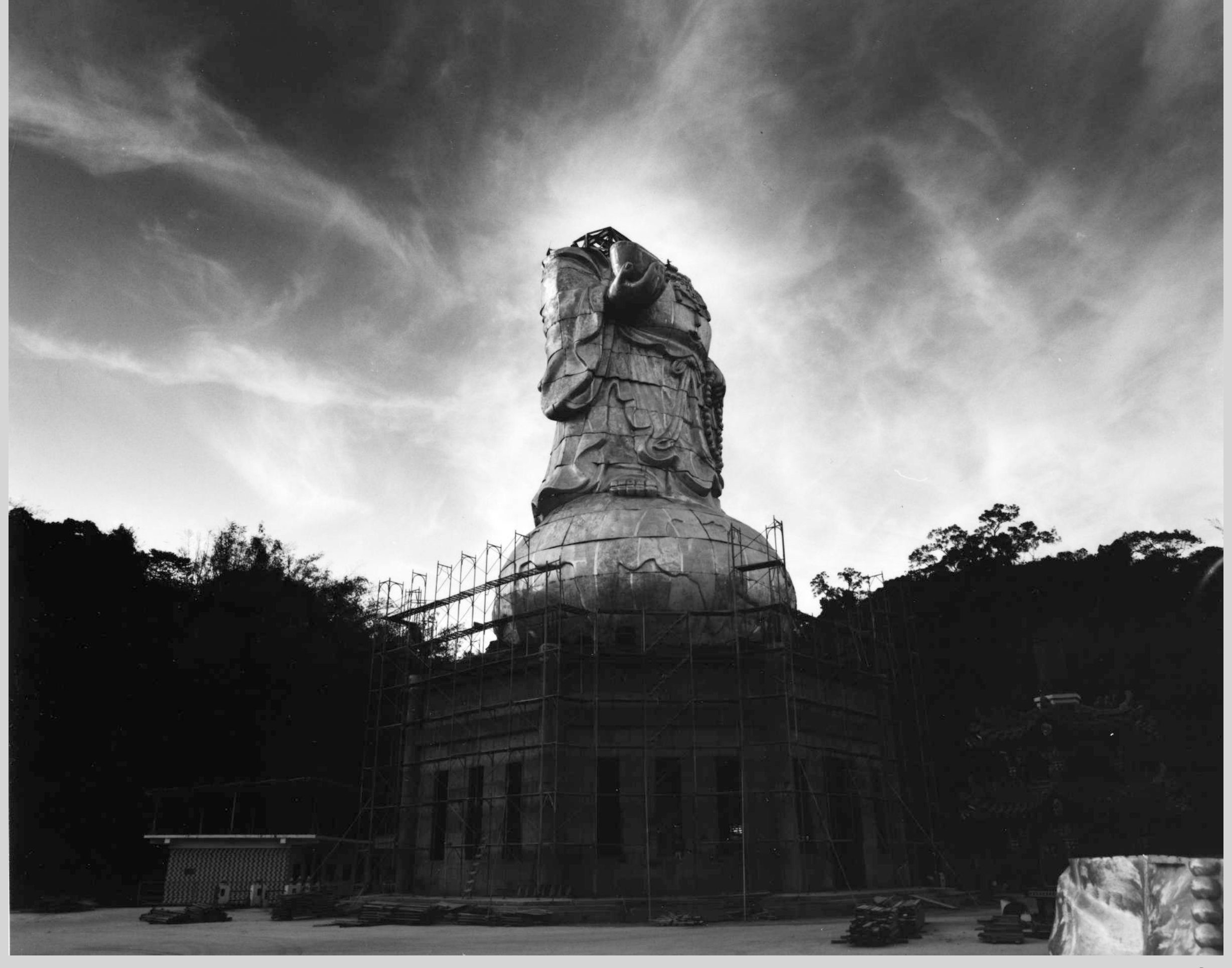
Yao Jui Chung TKG<sup>+</sup>