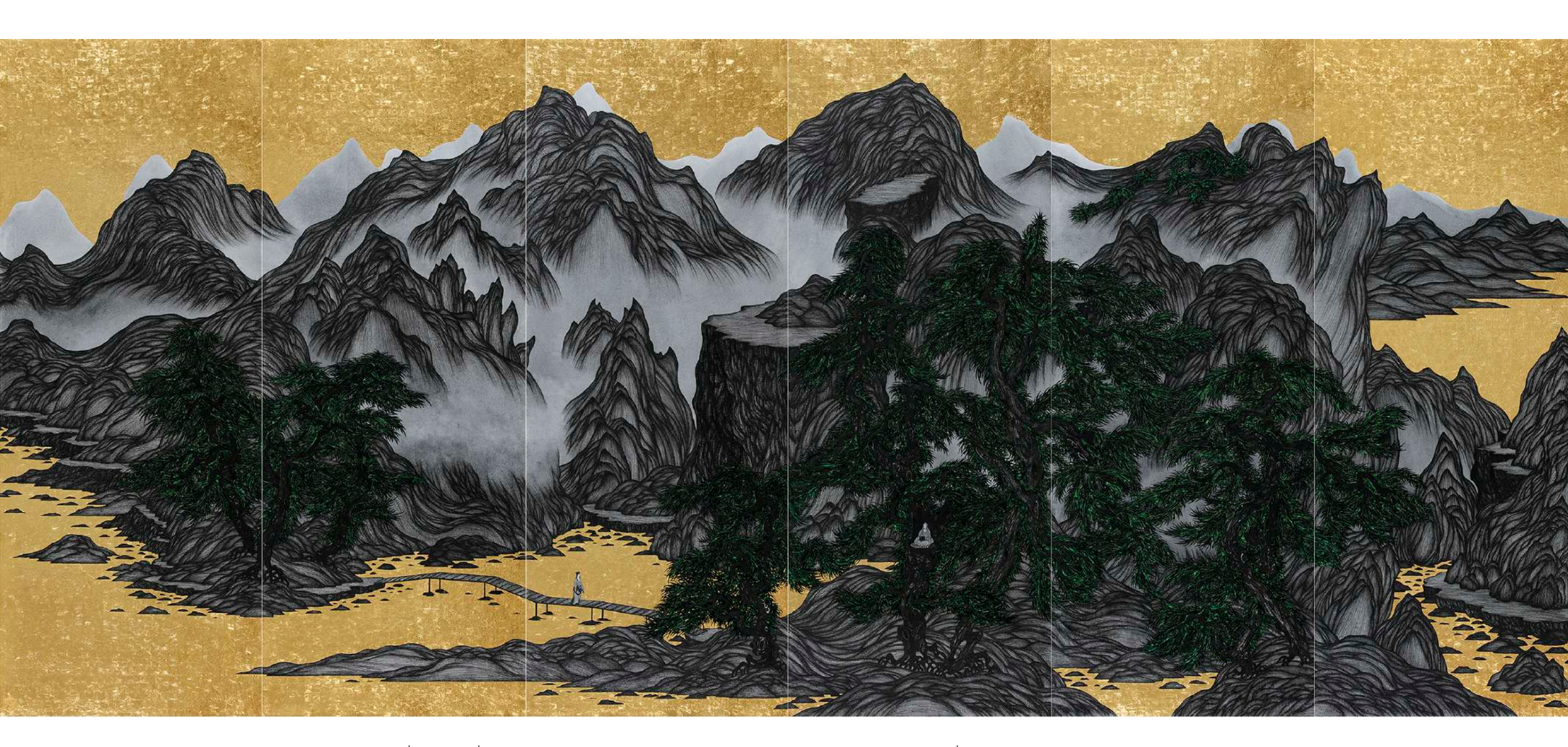
Vimalā-bhūmi: Nāgārjuna's Middle Way | 2019 | Gold leaf and ink pen on Indian handmade paper | 200 x 450 cm