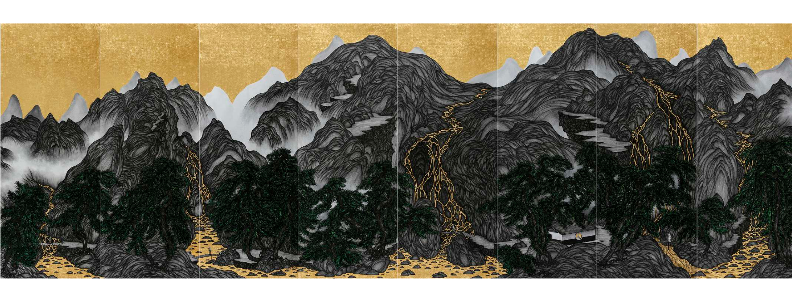
\emph{Vimalā-bhūmi: Tomiri} \mid 2019 \mid Gold leaf and ink pen on Indian handmade paper \mid 200 x 600 cm