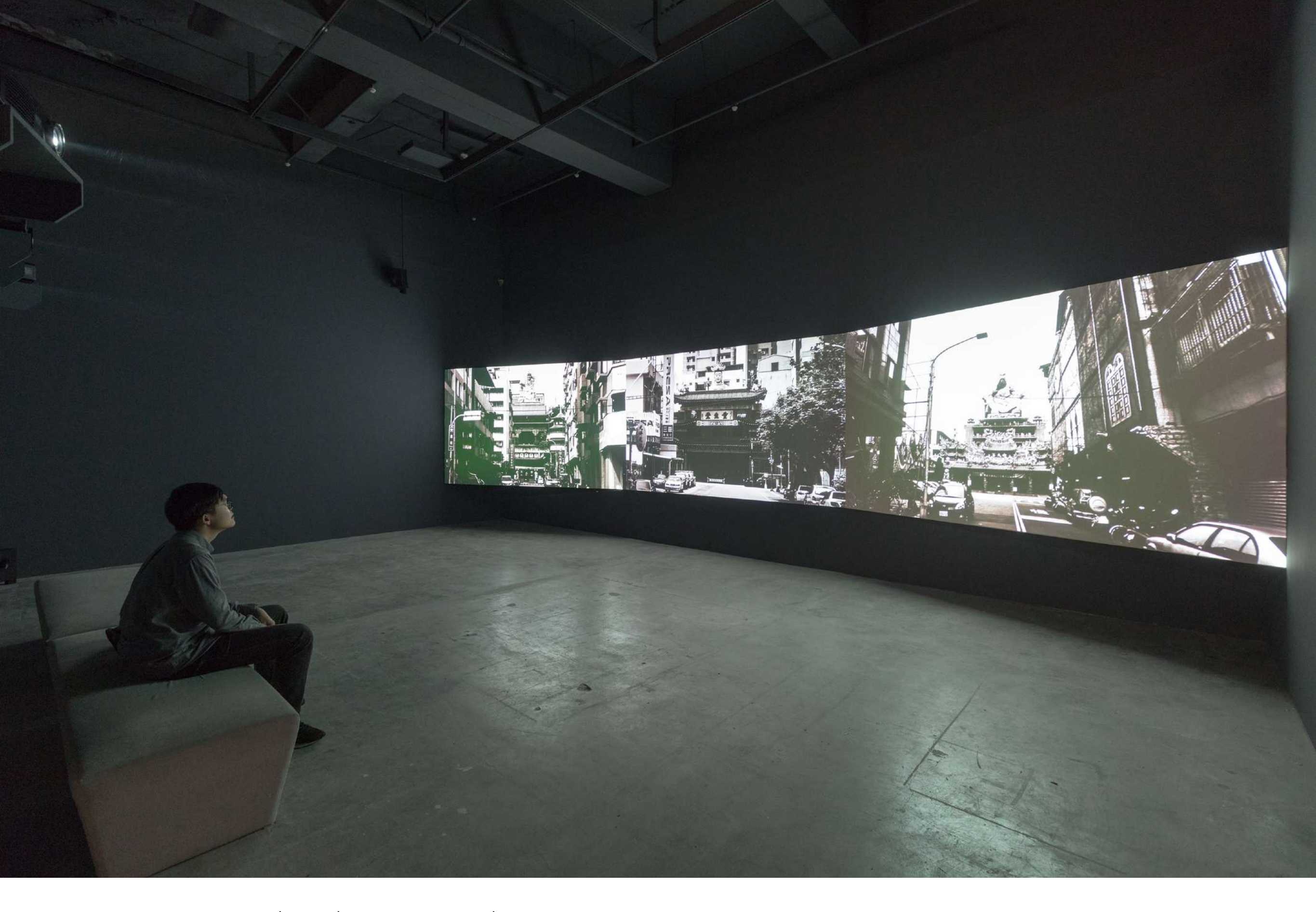
Incarnation (Three-channel video) | 2017 | Video installation | 14:28 minutes