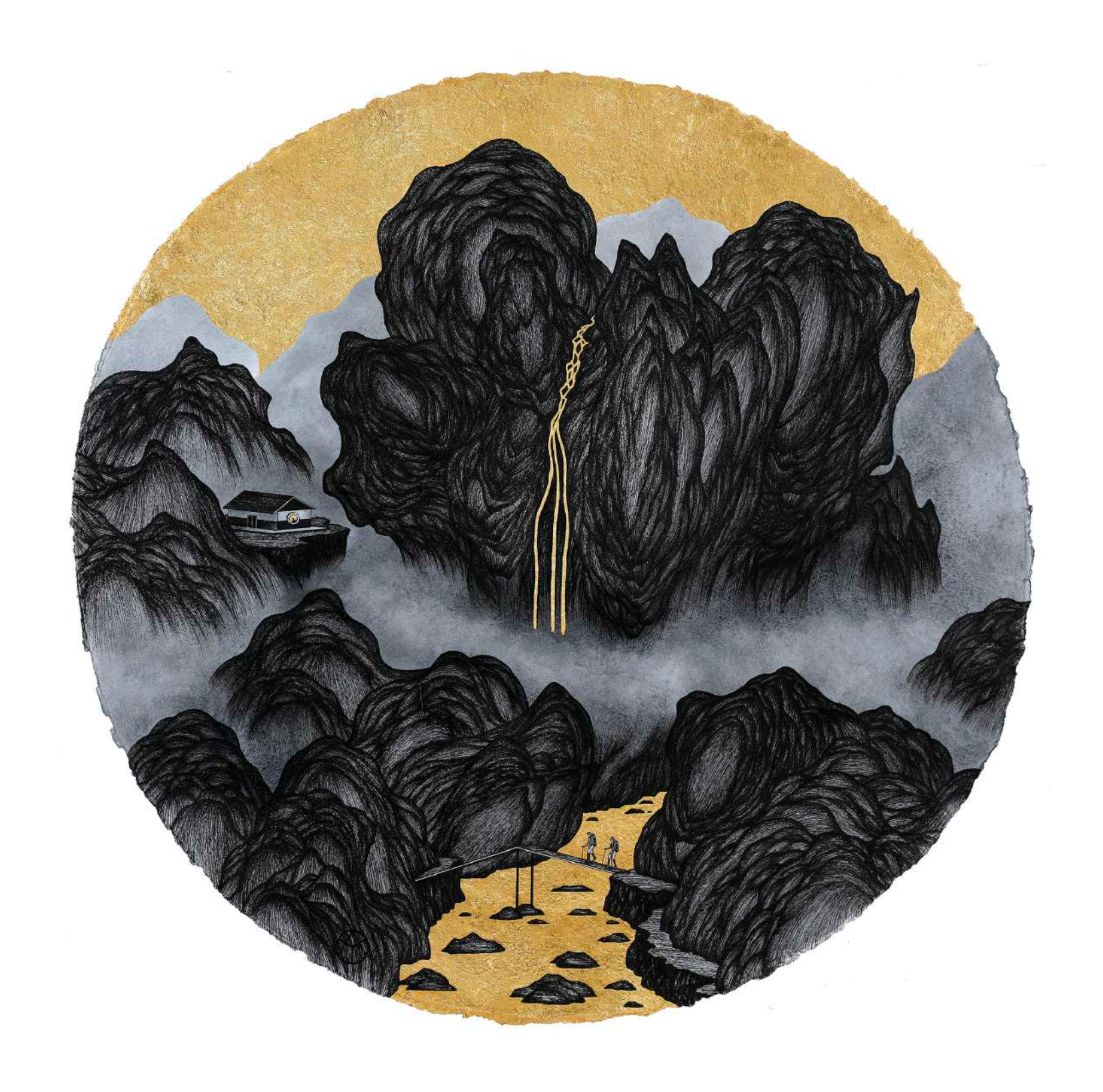
Cliffs & Gully: Hiking together forever | 2018 | Gold leaf and ink pen on Indian handmade paper | 110 x 110 cm