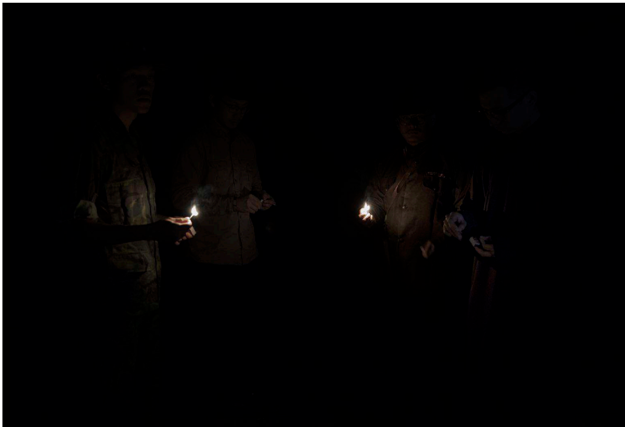
Towards Darkness, 2018 Immersive live Dimensions variable