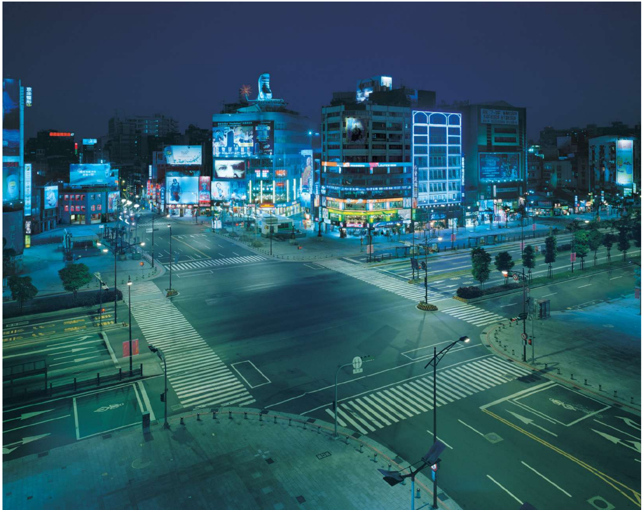
City Disqualified- Ximen District at Night, 2002