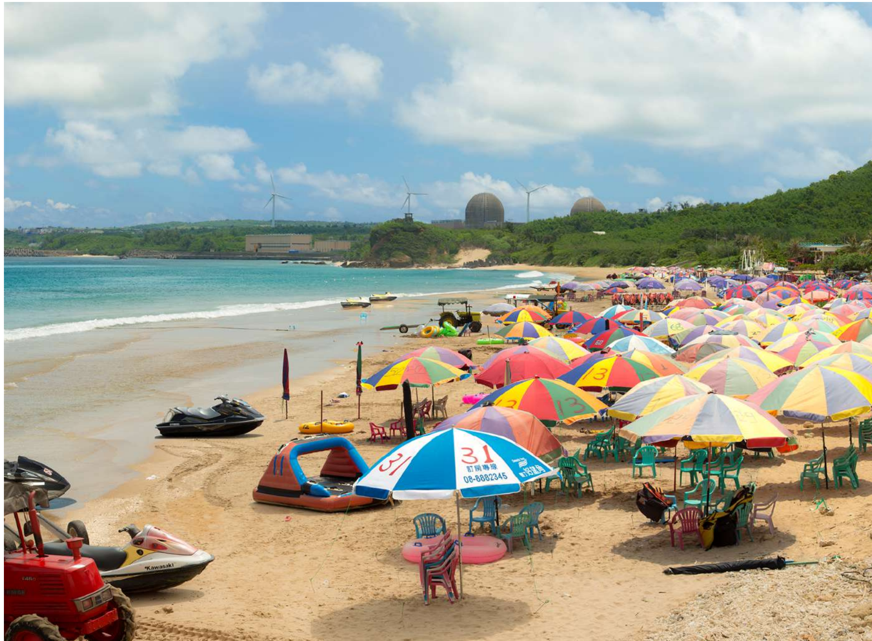
Landscape of Energy — stillness, 2014 digital photography 150 x 220cm