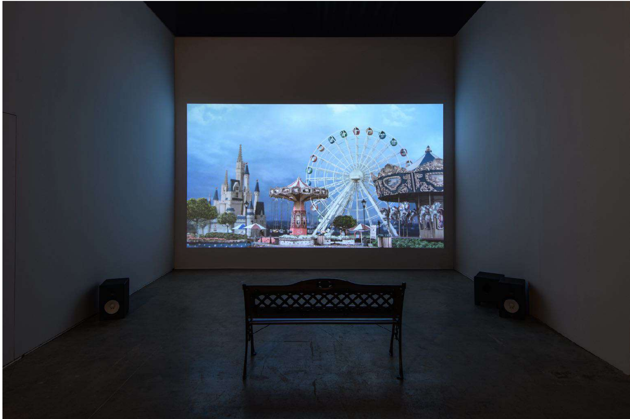
Tomorrowland, 2018 Video installation 4'57"