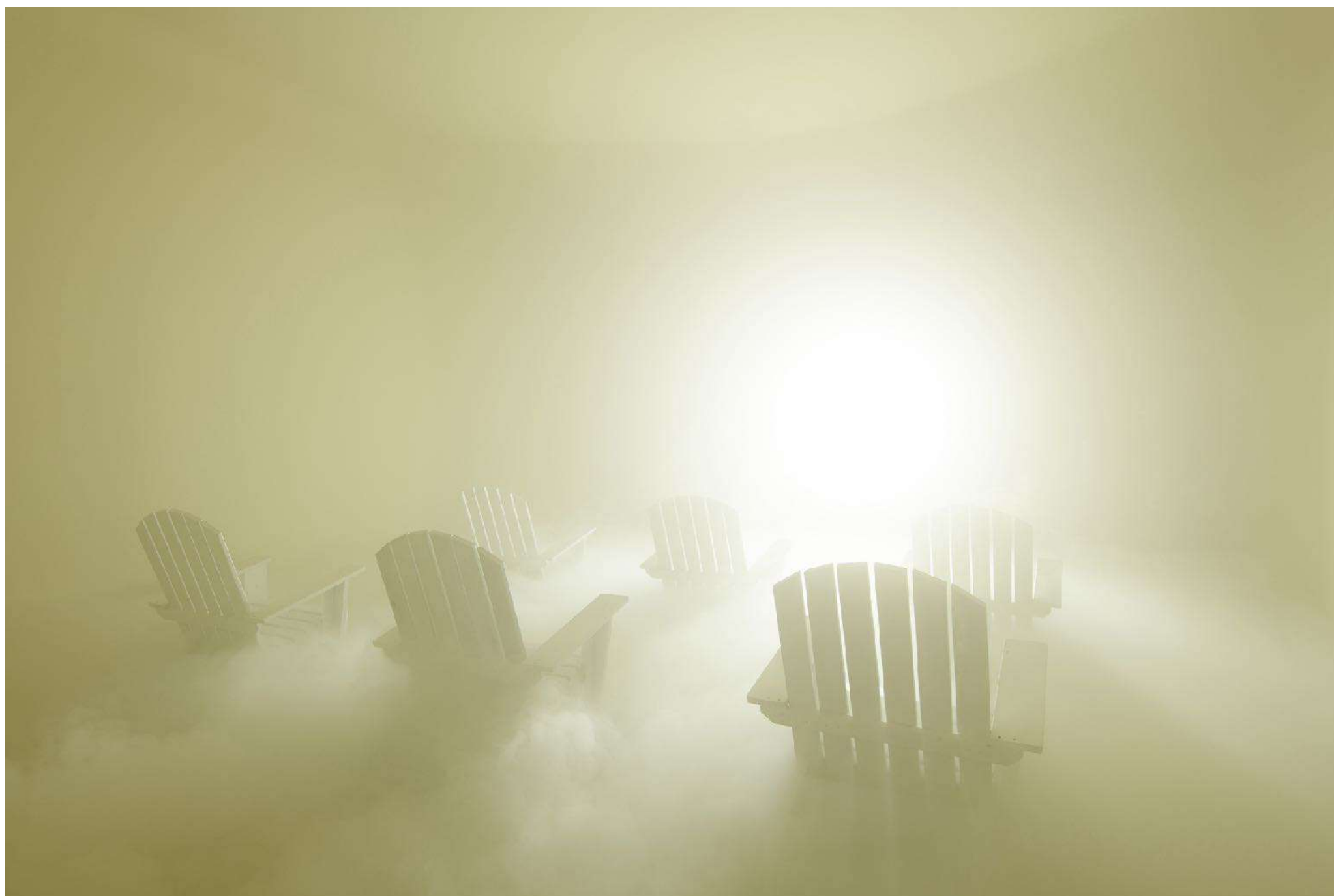
Towards Light, 2018 Installation Dimensions variable