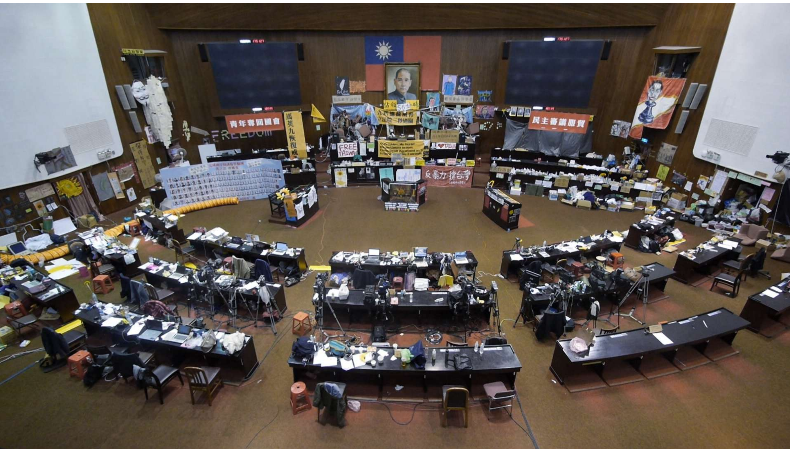
The 561st hour of occupation, 2014 single-channel video 5'56"