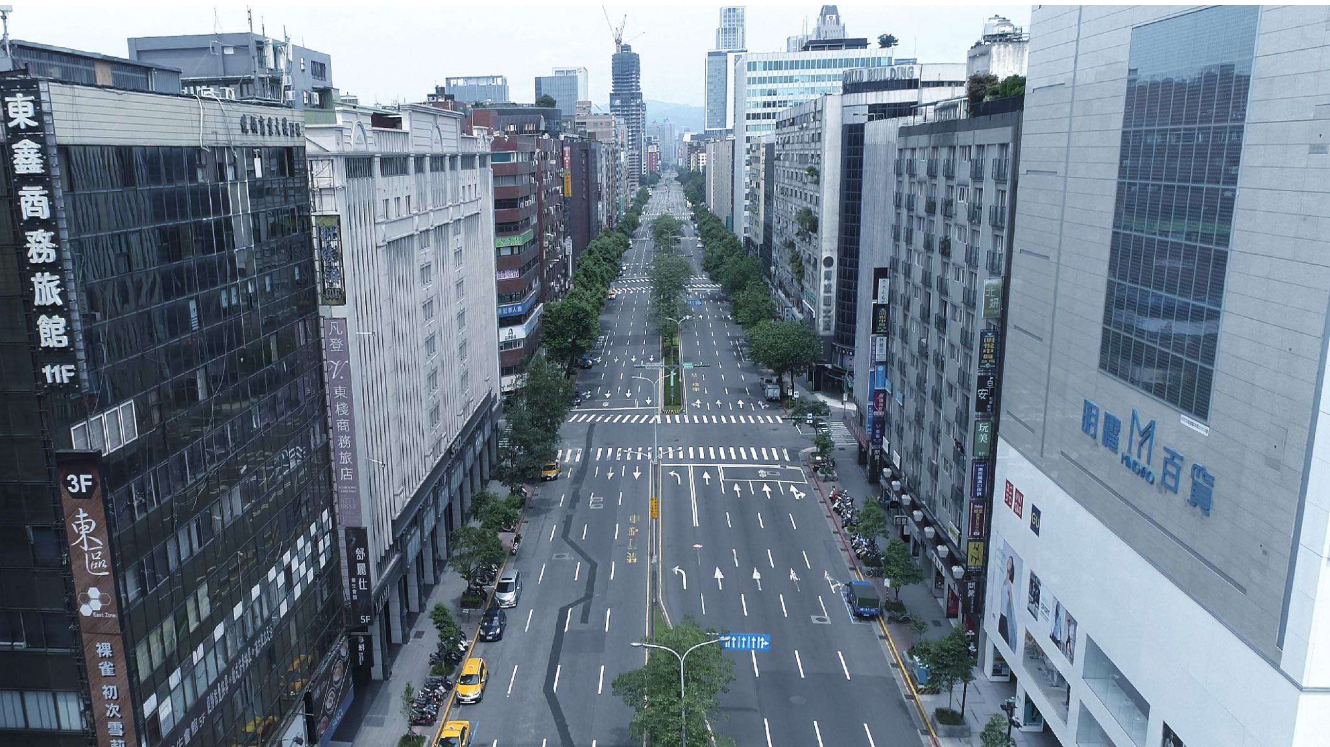
Everyday Maneuver, 2018 Single-channel video 5'57"