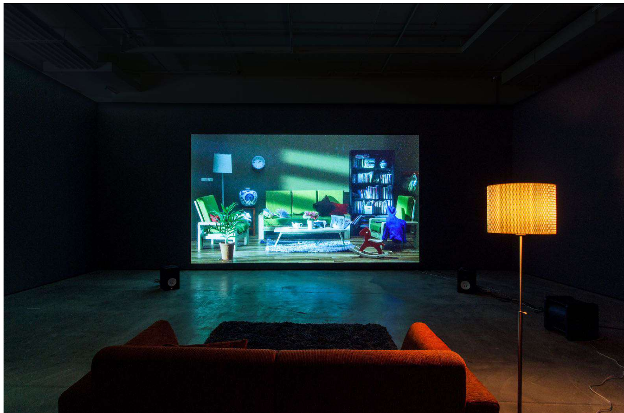
Dwelling, 2018 Video installation 5'00"