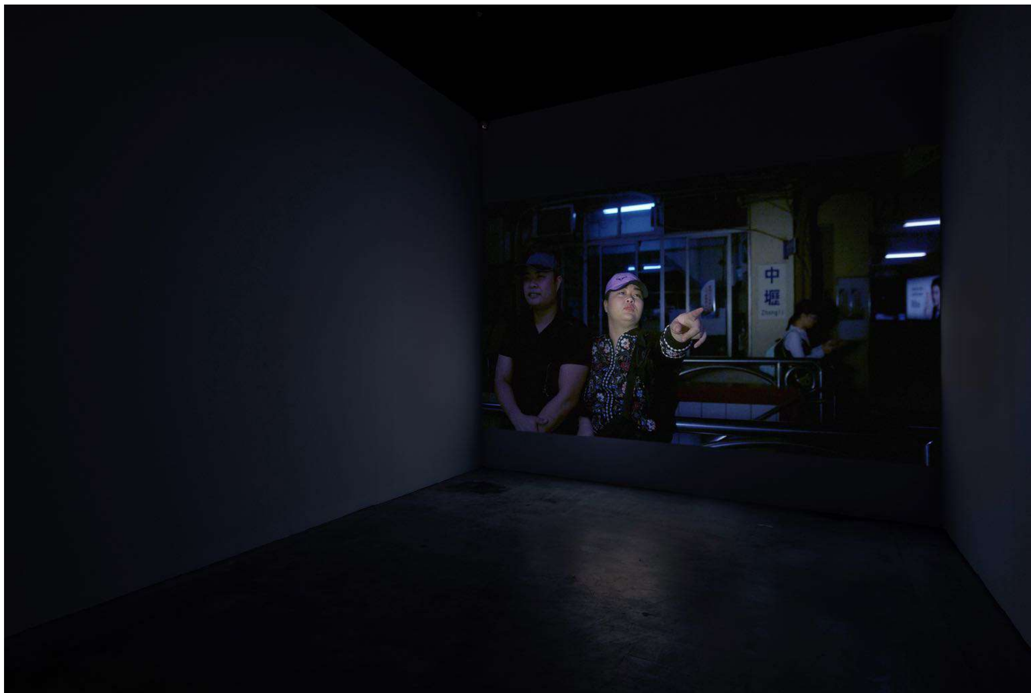
The Strangers, 2018 Single-channel video 6'24"