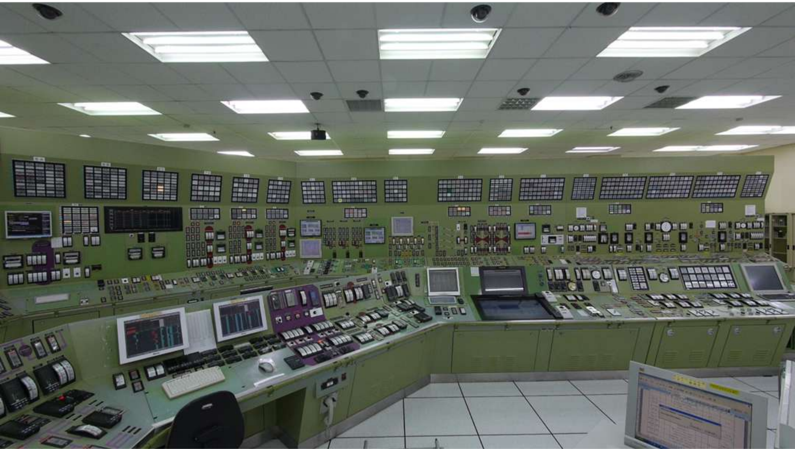
Landscape of Energy, 2014 single-channel video 7' 30"