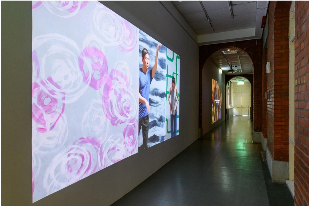
MOCA Studio, Museum of Contemporary Art (Taipei, Taiwan)- Being Question-George Ho Solo Exhibition , 10-12/2019, Taipei