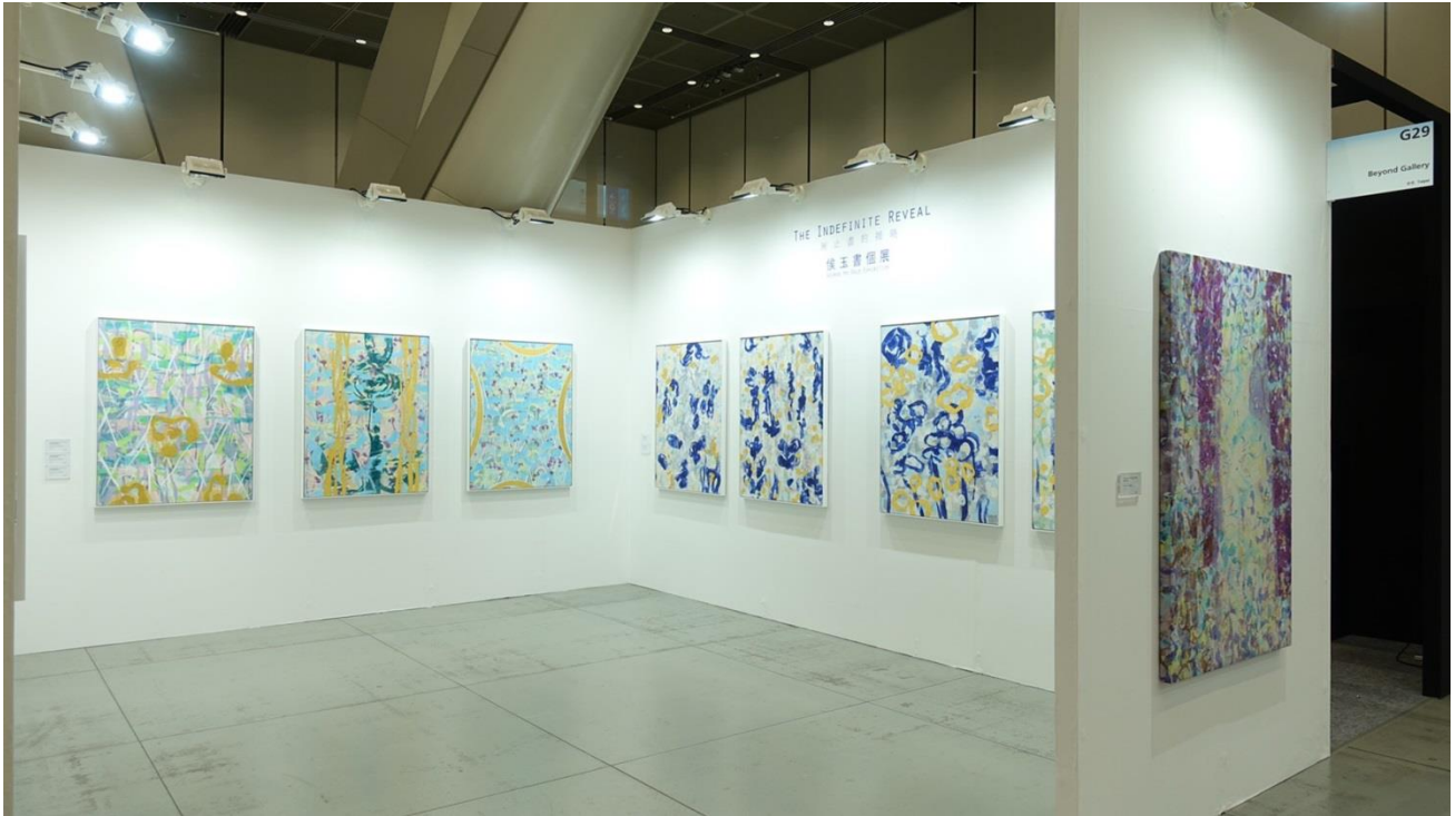
The Indefinite Reveal , George Ho Solo Exhibition, 2019 Art Fair Tokyo, Tokyo. 7-10 March 2019