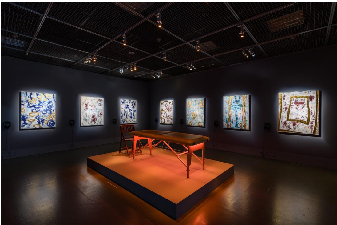
MOCA Studio, Museum of Contemporary Art (Taipei, Taiwan)- Being Question-George Ho Solo Exhibition , 10-12/2019