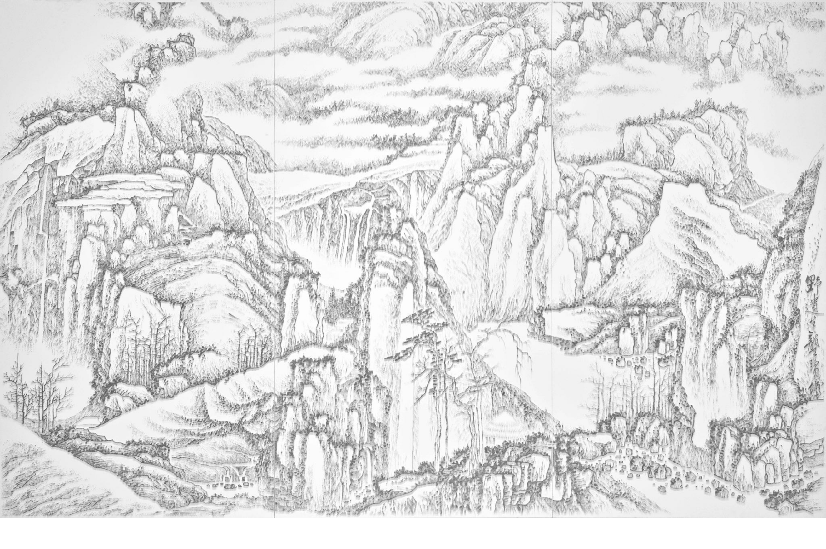
Imitating A Thousand Crags and Myriad Ravines by Gong Xian, Qing Dynasty 2017, Mosquito nail, canvas, and wood, 340 x 540 cm