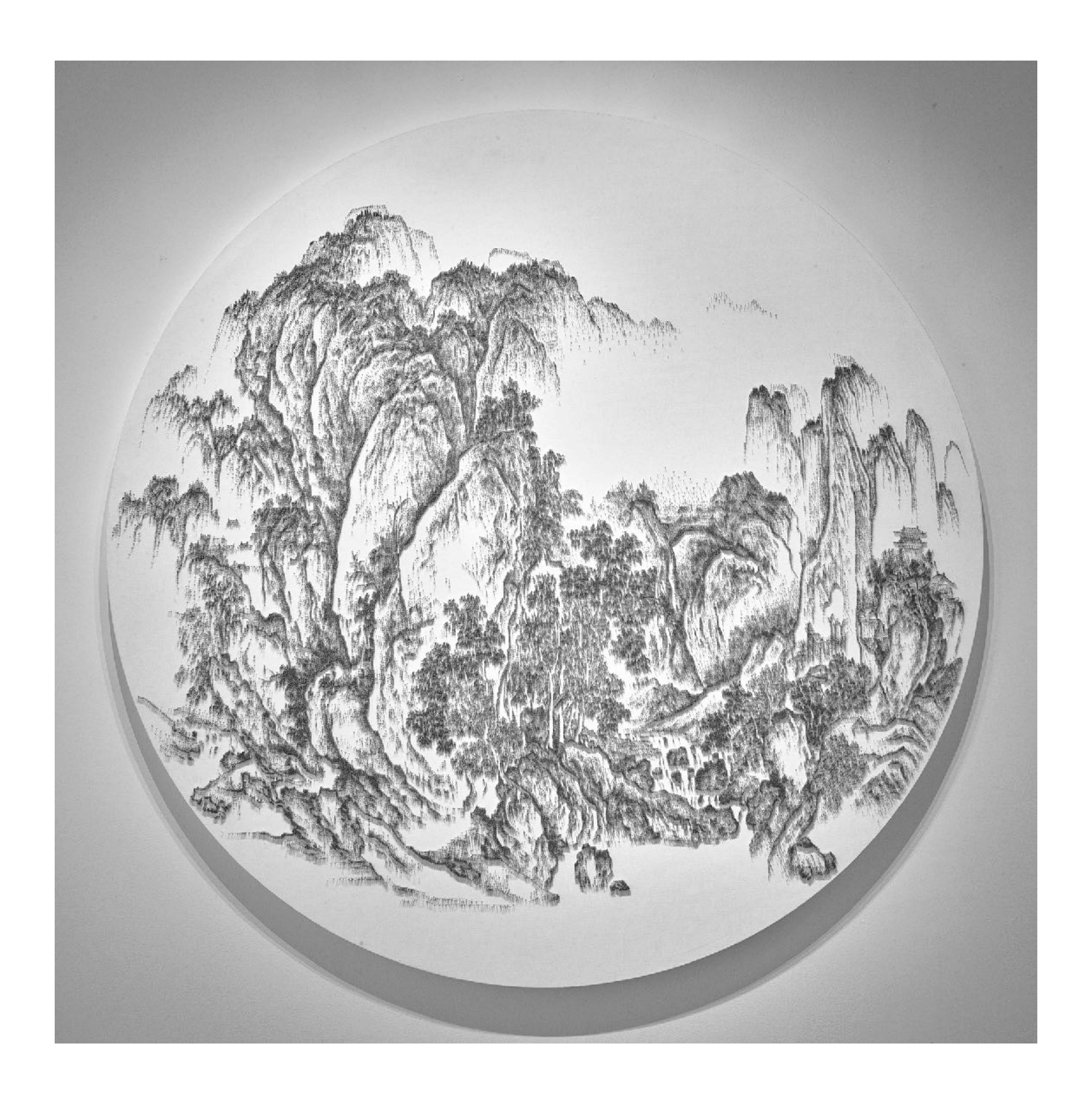
Imitating Streams and Mountains Without End, Song Dynasty 2016, Mosquito nail, canvas, and wood, 150 x 150 cm