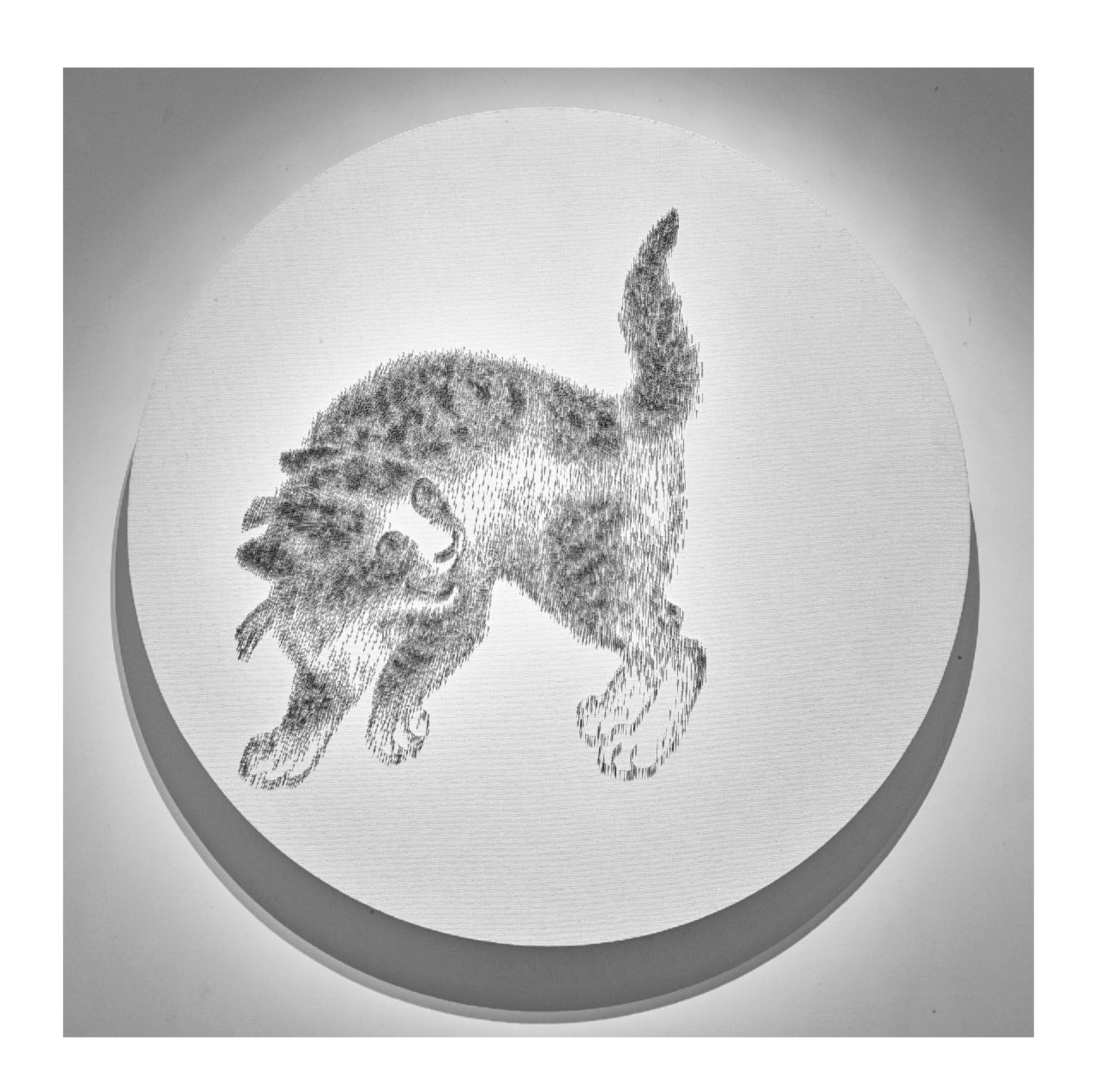
Imitating Monkey and Cats by I Yuan-Chi, Northern Song Dynasty (detail) 2016, Mosquito nail, canvas, and wood, 90 x 90 cm